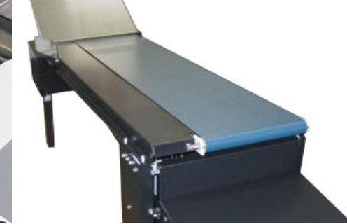
Optional long delivery conveyor